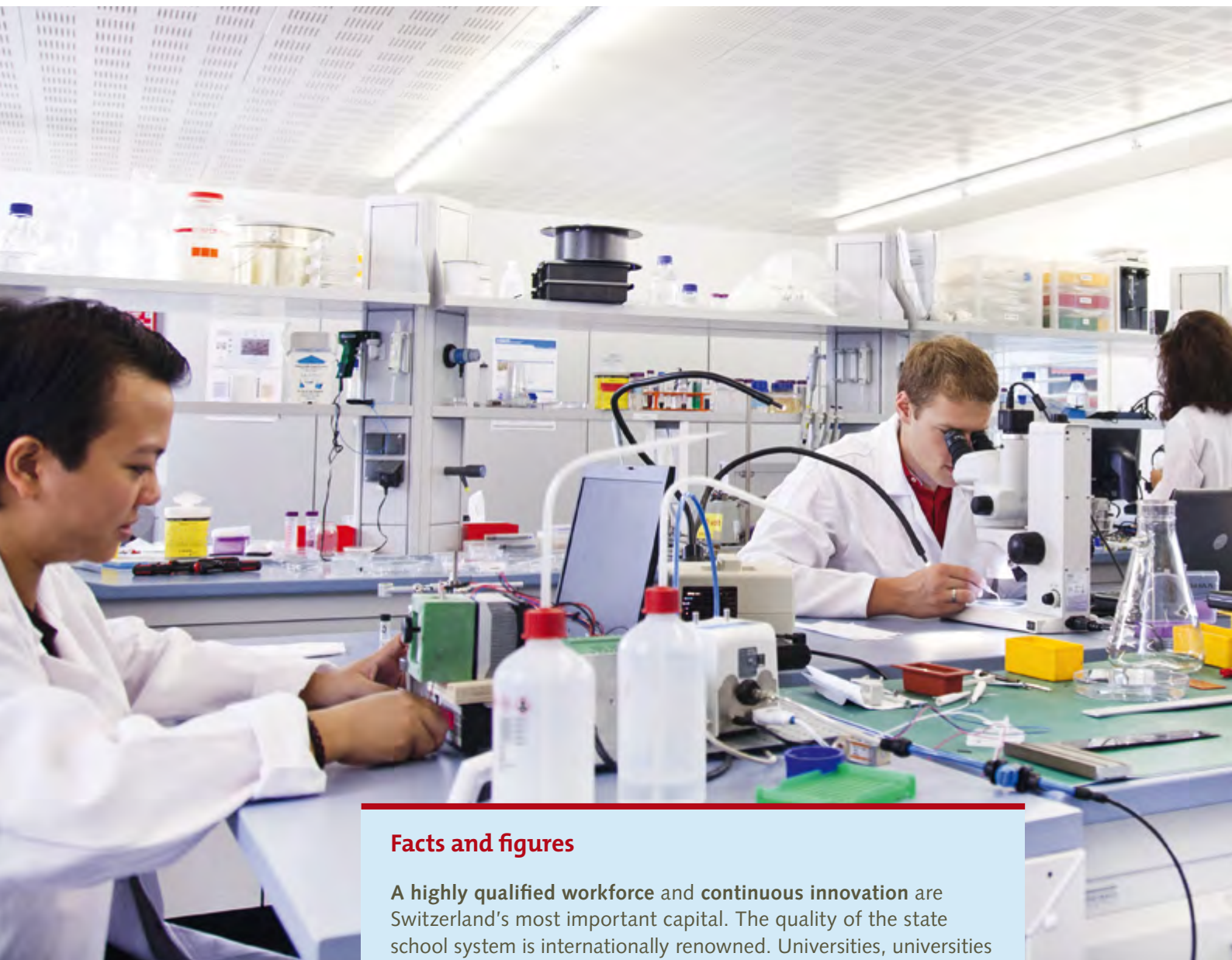
Micro-diagnostics laboratory CSEM Landquart