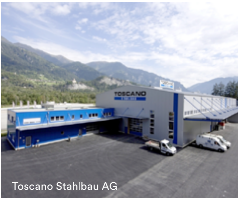
Toscano Stahlbau AG