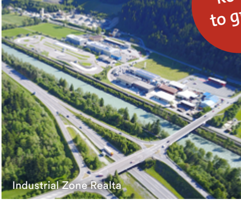
Industrial Zone Realta