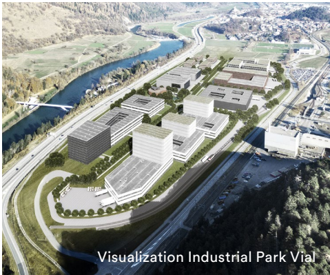
Visualization Industrial Park Vial