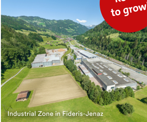
Industrial Zone in Fideris-Jenaz