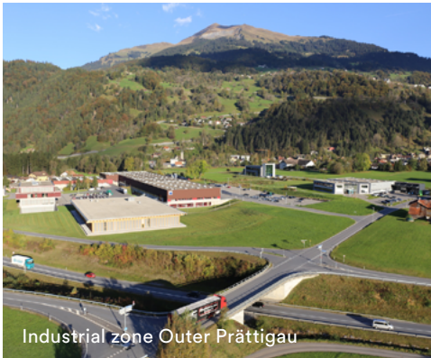
Industrial zone Outer Prättigau