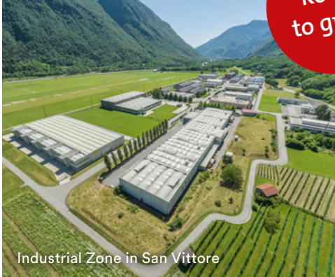
Industrial Zone in San Vittore