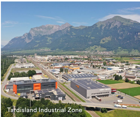
Tardisland Industrial Zone