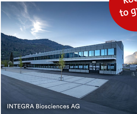
INTEGRA Biosciences AG